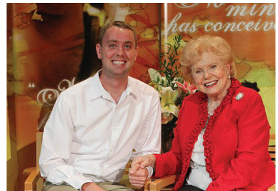
Vonette Bright founded Campus Crusade for Christ alongside her husband Bill Bright in 1951.

In a few weeks, I will be leaving Colorado and heading back to Merced where I will once again be looking to develop a team of ministry partners who will respond in prayer and financial giving. As I am stepping out and trusting God with an indefinite time in full-time ministry, so I am asking my partners to do the same in prayer and finances. I know that God will provide and I trust Him completely to bring in everything that I need. Please be in prayer for me as I begin this process.