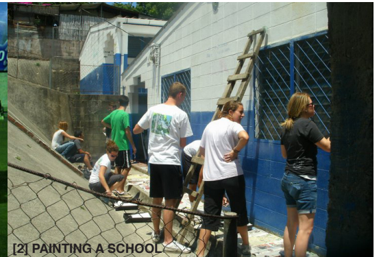
[2] PAINTING A SCHOOL