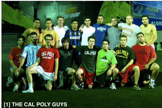
[1] THE CAL POLY GUYS